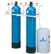
DOMESTIC WATER SOFTENER

We have DM Plant resins - cation & anion, water softener resins, super charge resins of almost every brand.