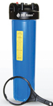
BIG BLUE FILTER