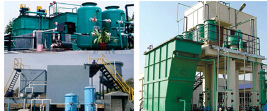
EFFLUENT TREATMENT PLANTS