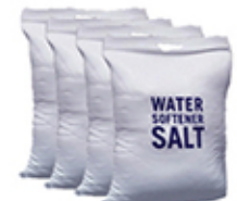
WATER SOFTENER SALT