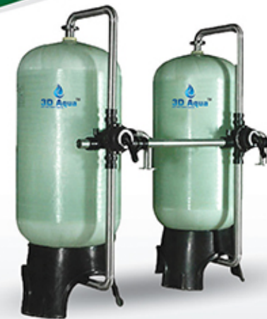
ACTIVATED CARBON FILTER